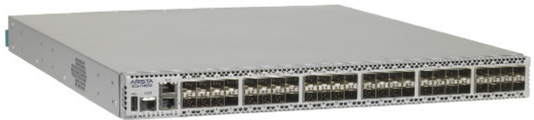
Arista 7148SX: 48-port 10GbE 960 Gbps, 720 Mpps, L2/3/4, 1U Switch (SFP)

The Arista 7100 Series is a family of high performance, very low latency layer 2/3/4 10 Gigabit Ethernet data center switches. Offered with 24 and 48 ports in a compact 1RU chassis with redundant power and cooling, the Arista 7100 Series features front-to-rear airflow when mounted in either direction for flexible rack-top server aggregation deployments. All ports accommodate the full range of 10GbE SFP+ or GbE SFP optical or copper physical layer options, allowing for maximum flexibility and investment protection as customers of all sizes migrate their server connections from Gigabit to 10 Gigabit Ethernet.