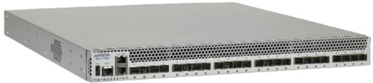
Arista 7124S: 24-port 10 GbE 480 Gbps, 360 Mpps, L2/3/4, 1U Switch (SFP)